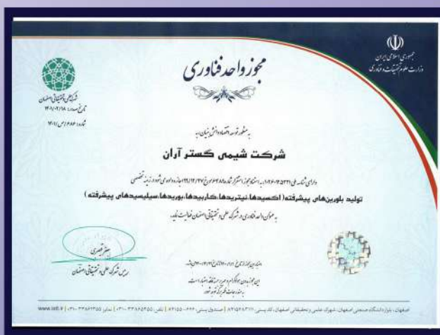
Technology unit license From Isfahan Scientific Research Town